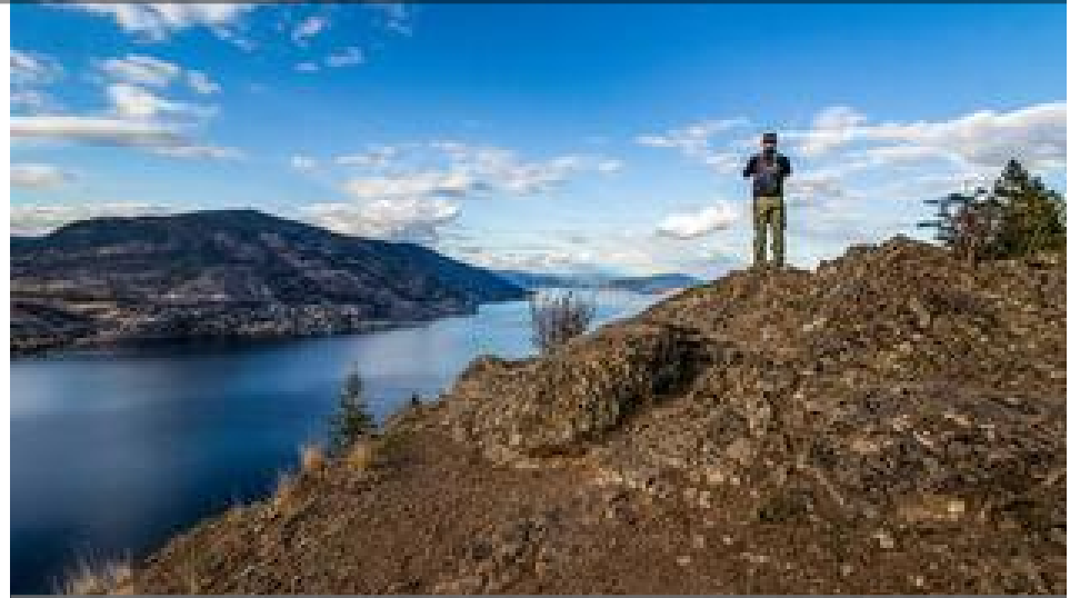
Lake Country Trail Map