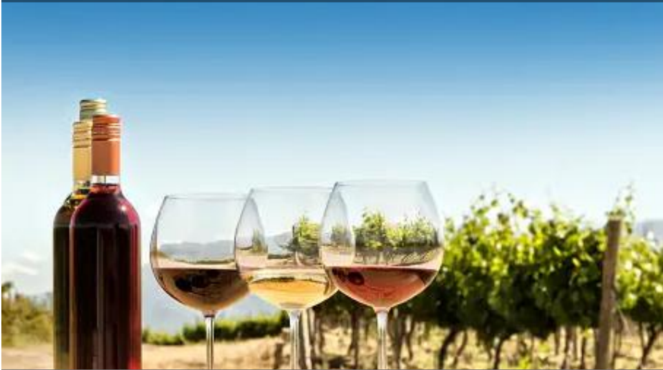
Lake Country Scenic Sip Trail

Opportunity to own a legacy piece of Lake Country nestled between Kelowna and Vernon.