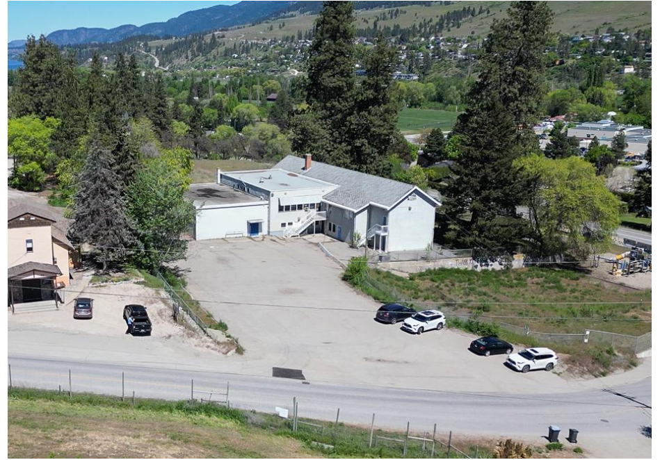
3130 BERRY ROAD, LAKE COUNTRY, BC