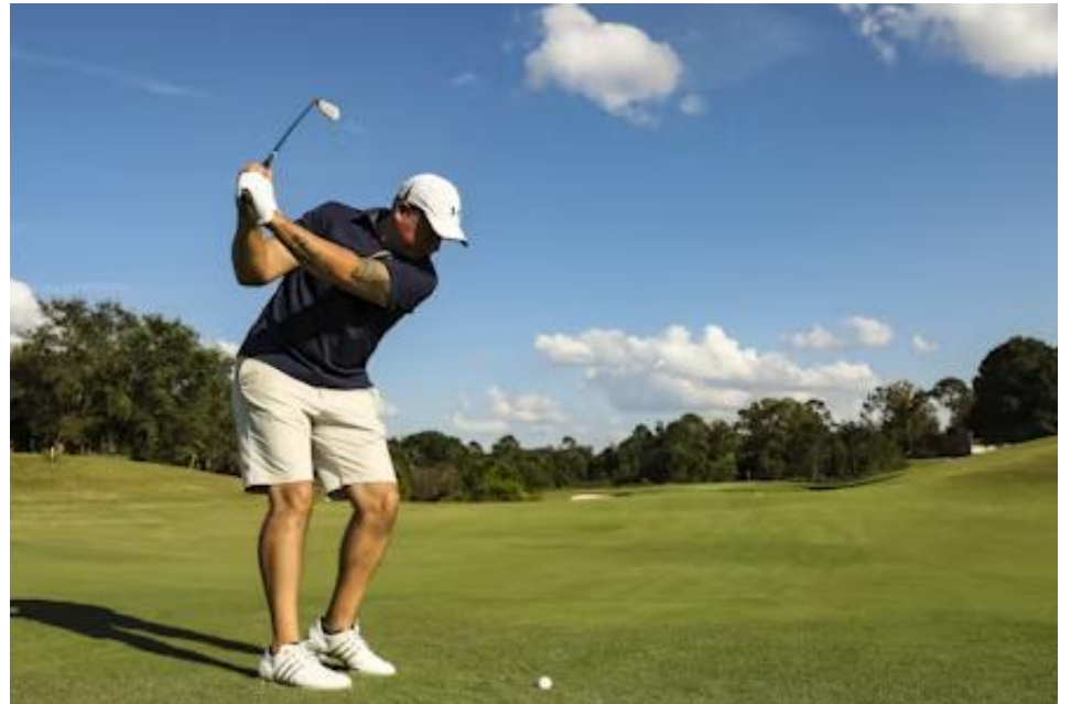
Lake Country Golf Guide