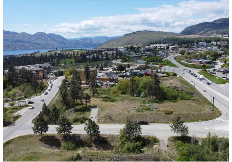
3630 CARRINGTON ROAD, WESTBANK,