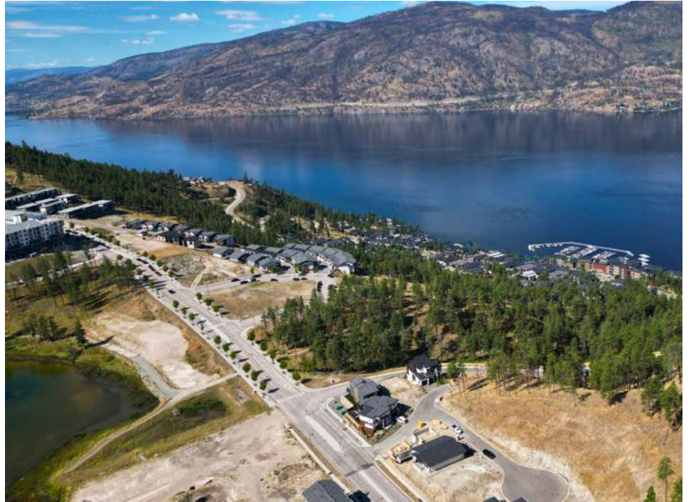
1810 HILLTOP CRESCENT, KELOWNA, BC