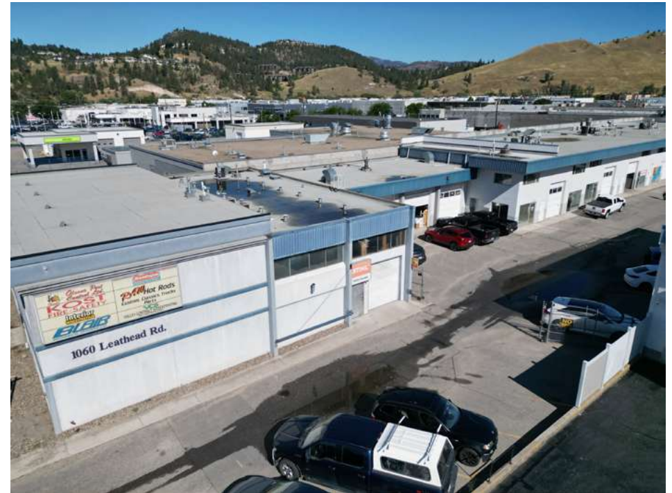
#8 - 1060 LEATHEAD ROAD, KELOWNA, BC

VCS VALLEY SCREENPRINTING "THE T-SHIRT PROFESSIONALS"