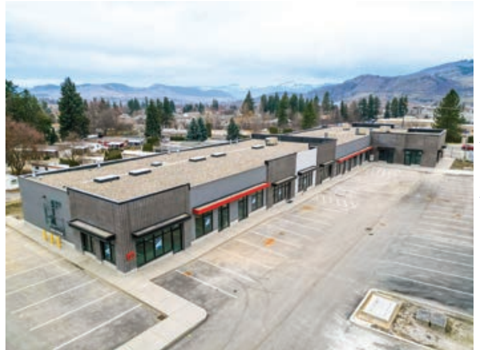
5000 SILVER STAR ROAD, VERNON, BC